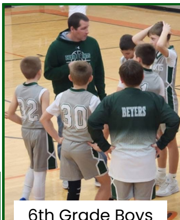
6th Grade Boys

St. Pat's 4th & 6th grade boys basketball team placed in the top 4 teams overall in The Hillsboro Hoopfest, qualifying them for a state tournament in March.