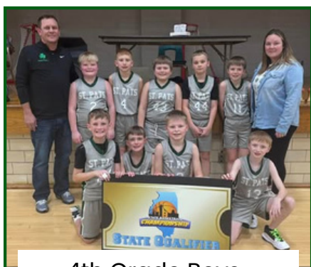
4th Grade Boys